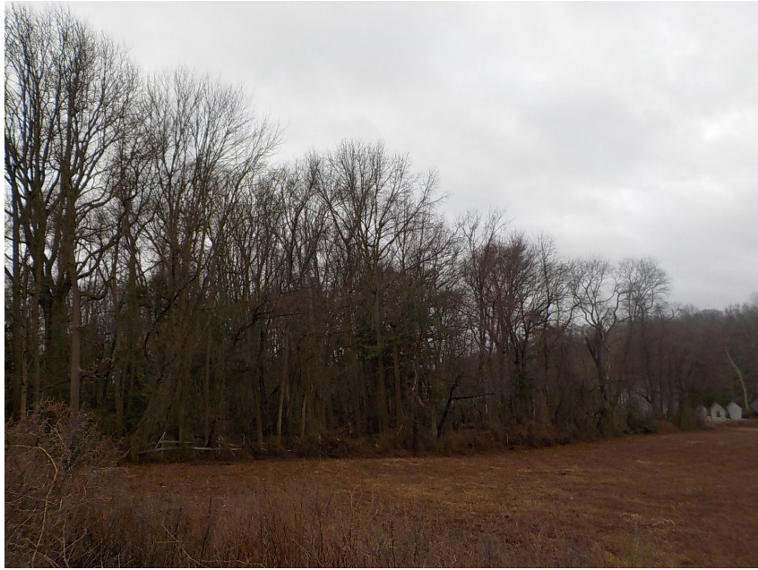
Typical Woodland Area