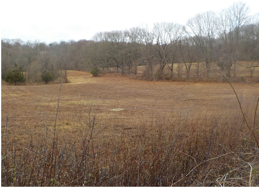
Open Portion of Property